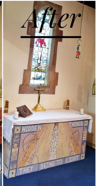
Our new Mining Mosaic