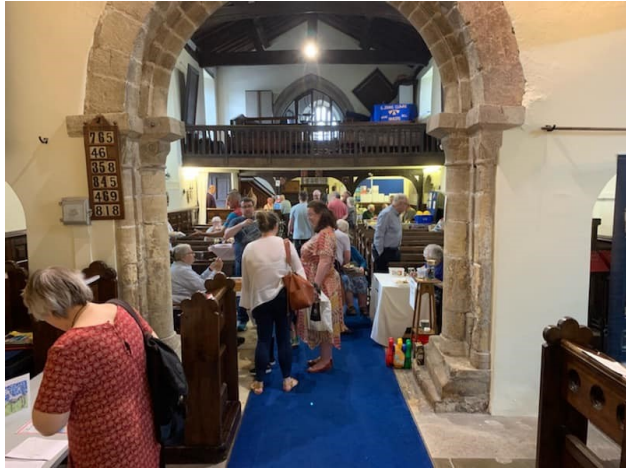
Church full of visitors at the Mining Festival 2019