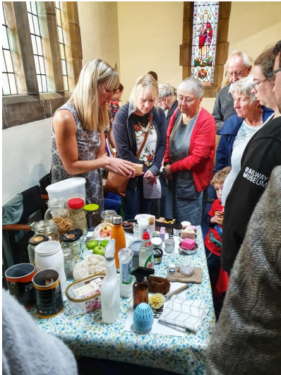
Learning about reducing plastic at Harvest in 2019

Going forward: Since the pandemic we have had to adapt the ways in which we worship and we have seen a great deal of growth not just in personal faith but in new people accessing our worship via many different means both online and over the phone. What I am now calling 'hybrid' worship will be the new norm and I am excited by the possibilities.