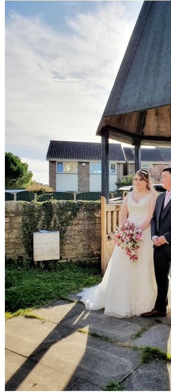
One of our 2019 weddings