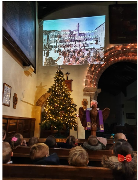
Clowne Infant School comes to church for Christmas