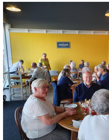
Harvest Supper 2019